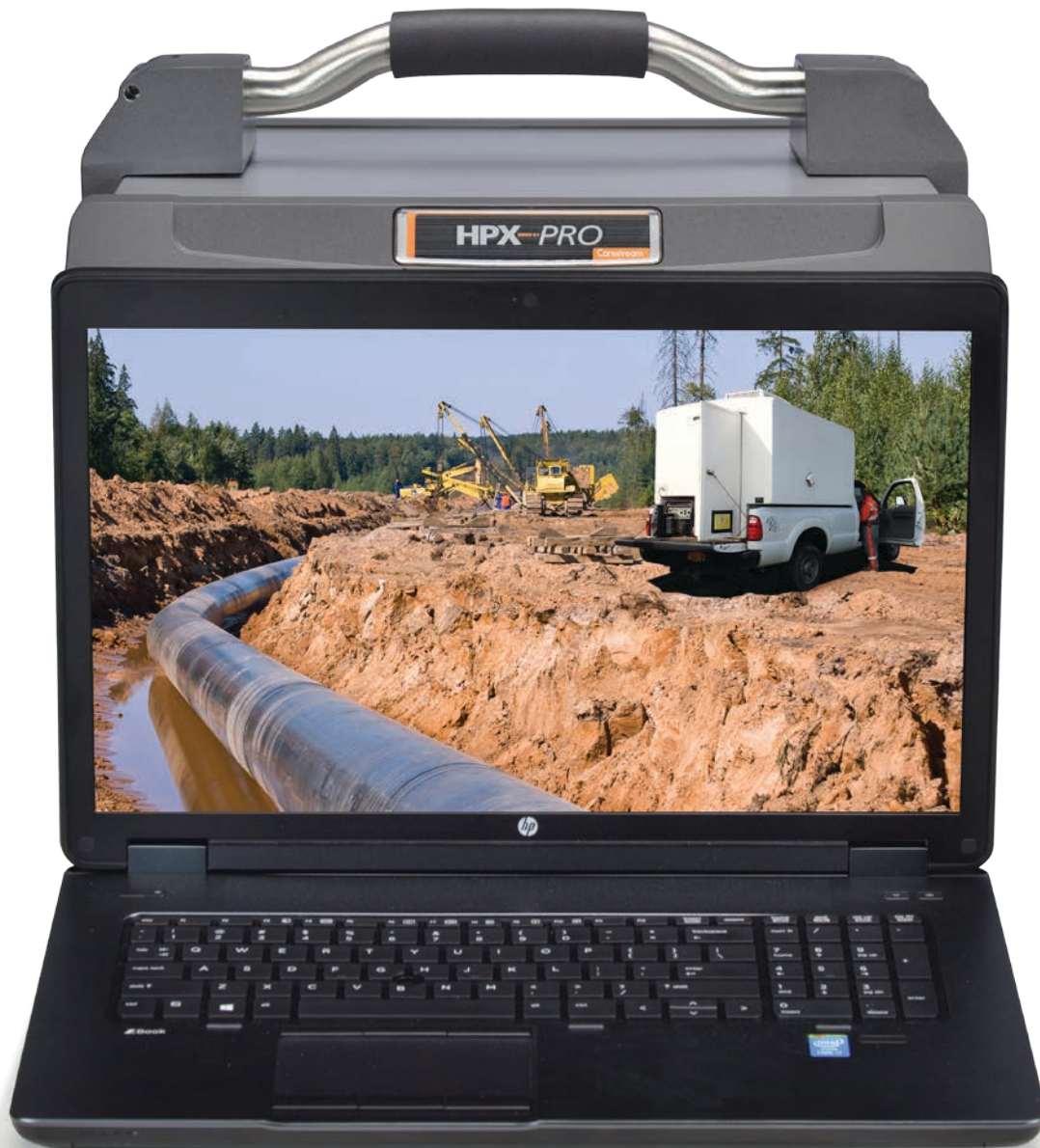
Product size to scale.

to keep in pace with extreme process conditions like pipeline imaging. The new software tools also provide quick image analysis and customized reporting for generating unique customer reports in seconds. From hardware to software, to deep in the field and instant image sharing, the HPX-PRO is a complete system, designed to improve productivity.